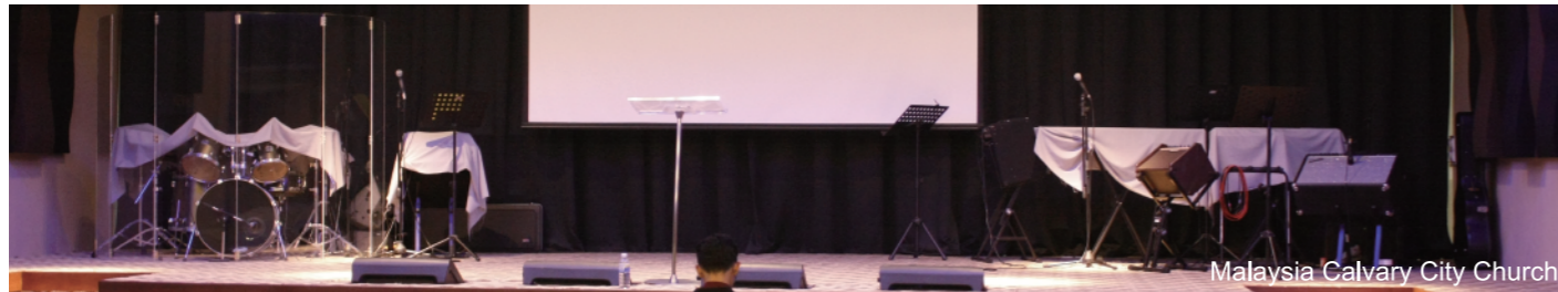
Malaysia Calvary City Church