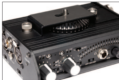
XL-CAM Accessory Mount (not included)