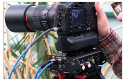
XL-3 Accessory Cable for DSLR connection (not included)

Discover more about Sound Devices products at www.sounddevices.com